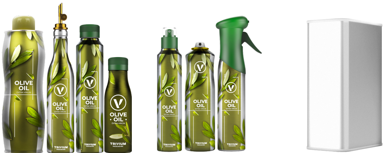
Liquid Pour Spouts

In recent years, metal packaging manufacturers have expanded the capabilities to form metal into a wide variety of shapes and formats. While large square gallon tins have been part of the bulk market for decades, and oil aerosol cans are recently an established necessity in many home kitchens, these formats only scratch the surface of what can be done with metal. These new formats open the opportunity for new use cases, new delivery systems, increased sustainability, and improved consumer experience. Metal packaging today falls into three major categories: Aluminum liquid pour spouts, sprays and pump systems, and large volume steel containers.